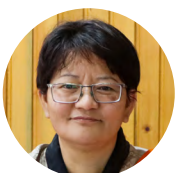
H.E. Dechen Wangmo Minister of Health Government of Bhutan