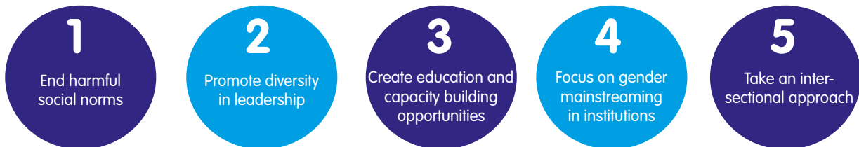
Figure 2: Priority themes to enable gender transformative leadership

Our engagement in this research provided fresh insights into the critical and varied roles that gender transformative leaders can and do play in facilitating more gender equitable and socially inclusive WASH systems, policies and services. The leaders we interviewed opened our eyes to the rewards, challenges and benefits of transformative leadership, showing us what is possible.