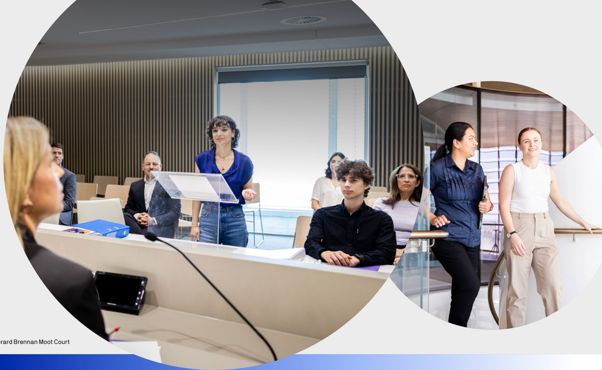
Faculty of Law Sir Gerard Brennan Moot Court

UTS Law is committed to innovative, supportive and high quality legal education for the future which is valued for its contribution to society and excellent student experience.