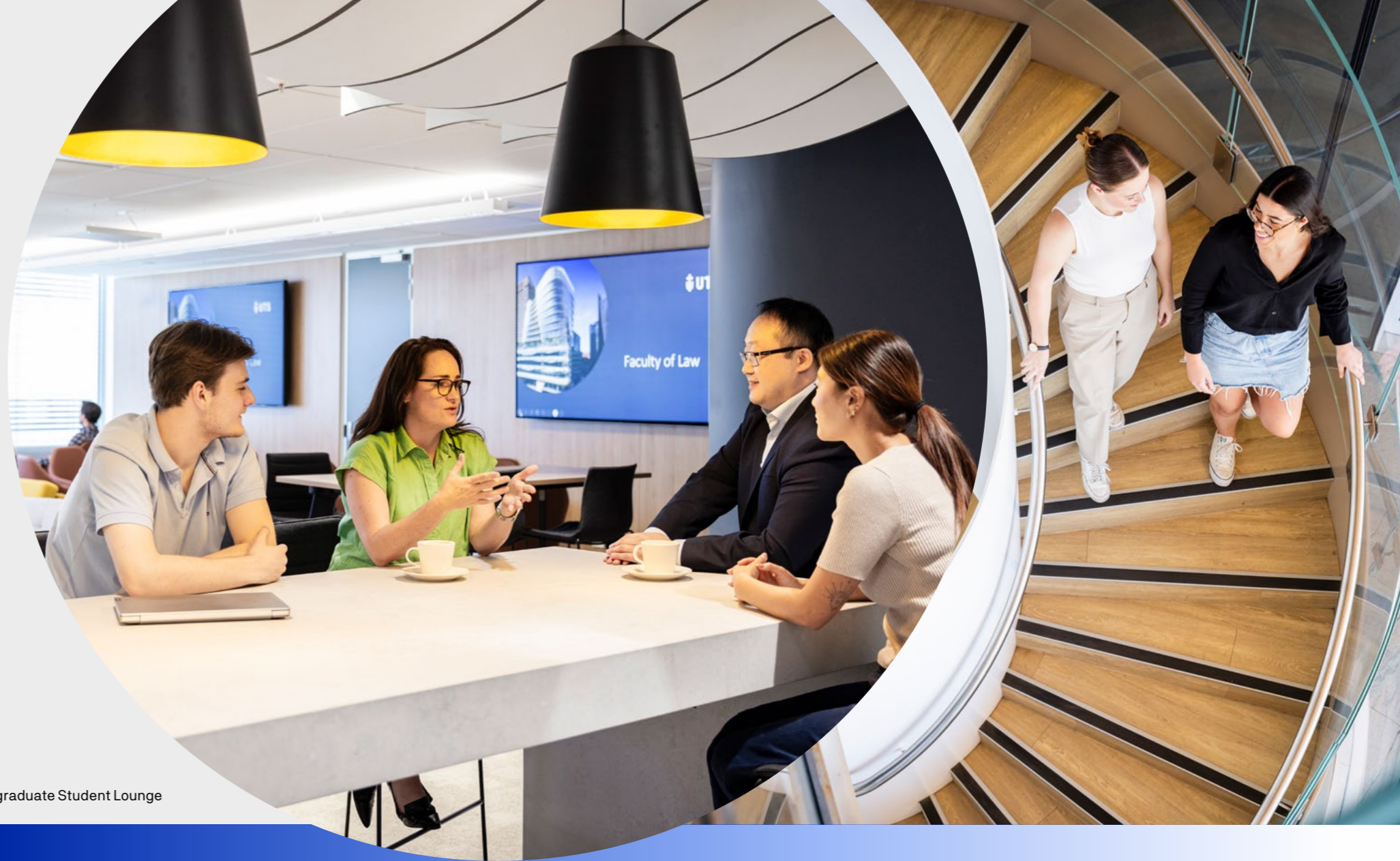
Faculty of Law Postgraduate Student Lounge

UTS Law researchers investigate legal matters of significant community, national and global importance. Our scholars are bold, ambitious, and creative, and we shape debates, research agendas, law, practice, and policy. Our scholarship is characterised by excellence, rigour, and integrity. Our research contributes to the depth and strengths of our teaching programs.