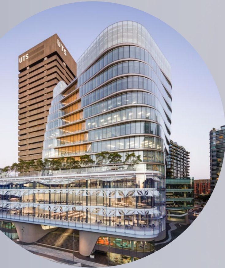
UTS Central – Building 2: Faculty of Law

Our vision is to create knowledge and drive debate. To lead ethically. To create positive social change. To centre Indigenous excellence. To harness law and technology for a just and sustainable future. To be kind, community focused and accessible.