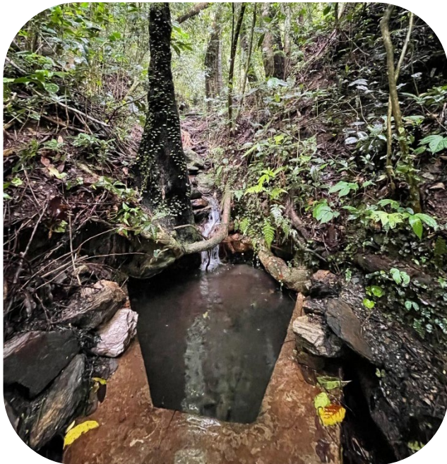
The natural spring in the mountain has spiritual significance for the community.

Exploring financial models for long term sustainability of water management. As part of the GMF, households contribute a small amount of money on a monthly basis to support O&M of water infrastructure. The Morcoluli GMF plans to continue to collect community funds as an ongoing source of revenue for O&M. Several participants, including members of the GMF, noted that the amount of funds the GMF has collected is insufficient to make significant repairs. GMF participants did not seem to be aware of the option to access up to 15% of the funds required for higher O&M costs from PNDS, highlighting an opportunity for increased information sharing and awareness raising by PNDS.