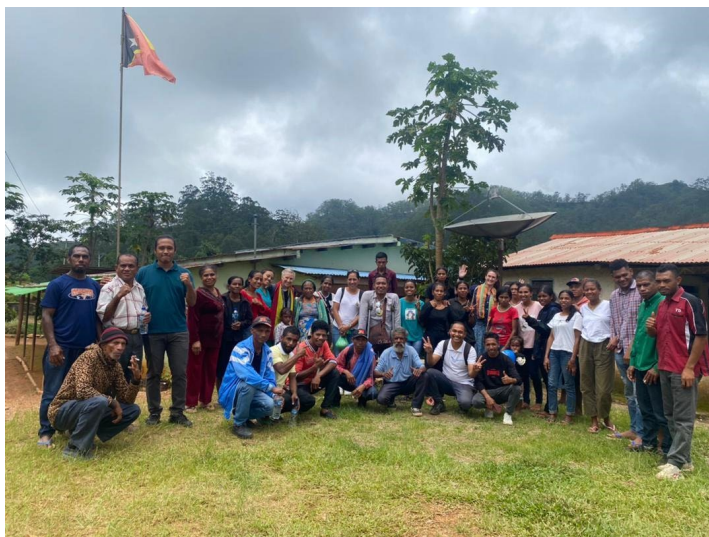
Community participants from Morcoluli and the research team on the last day of data collection.

Approximately 70% of families in Timor-Leste rely on some form of farming activity for their livelihoods. In Morcoluli, most households rely heavily on coffee as a source of income, selling it at the market in a nearby town. Travel to the market is via a single road which takes 40 minutes by motorbike. Continued access to the market is therefore a key priority.