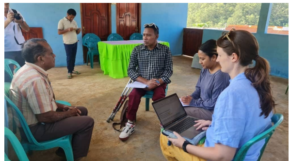
The research team interviews community members in Morcoluli

People with disabilities and their family members expressed their wishes to be included in activities, while the family member of one woman with a disability described her sister being rejected from a PNDS employment initiative because of her disability, even though PNDS had promised to include people with disabilities. Separately, the Suku Chief expressed his motivation to encourage people with disabilities' active participation in all village activities, and his interest in connecting and collaborating with municipality representatives to strengthen disability inclusion in the Suku. This was in the context of the Suku Chief and other residents of Morcoluli, recognising one of the PARTISIPA research team members - a person with a disability - from DFAT's social media posts about opportunities to study in Australia and being inspired by their accomplishments.