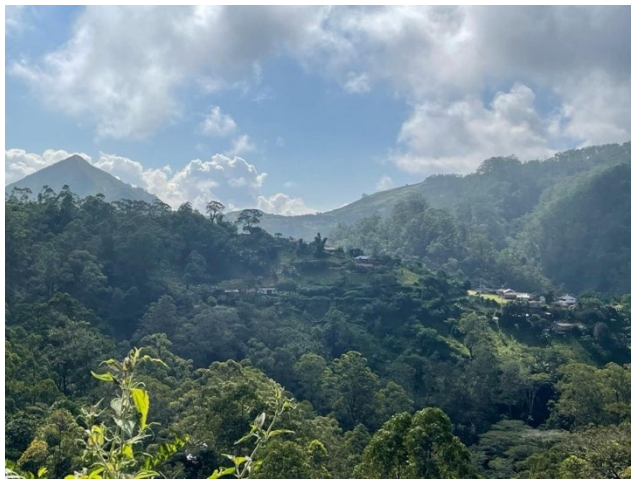
Morcoluli is located in the mountains of Manufahi Municipality

The lack of water during dry seasons causes particular challenges at the local primary school, where toilets overflow and pose sanitation and hygiene risks, and children, not being able to shower, develop skin rashes. The health worker who is posted to Morcoluli now stays in the neighbouring town of Turiscaï (a 40-minute drive from Morcoluli) due to lack of water at Morcoluli health clinic, limiting access to healthcare for residents of Morcoluli. Unequal access to water sometimes leads to conflicts between families, which have to be resolved by the Suku (village) Council 1 .