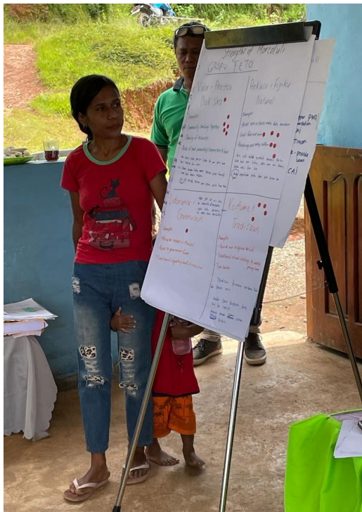
Workshop report back from the women’s group.

Together, groups discussed which of these strengths will be most important to sustain or build upon into the future to strengthen resilience to climate change and disaster risks, and why.