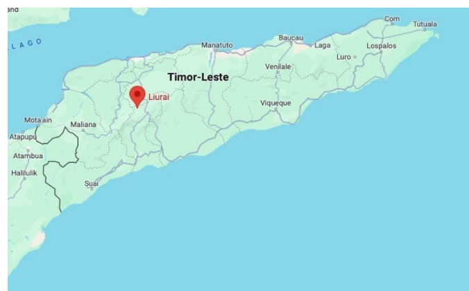
Figure 1: Map of Timor Leste showing the location of Liurai village – the location of Morcoluli community

Much of the Morcoluli population farm coffee, and sell it and other agricultural products such as corn, potatoes etc., at the Turisca market, with profits comprising their primary income. Accessing the market via the single road, which takes 40 minutes to travel to on motorbike from Morcoluli, is therefore a key priority.