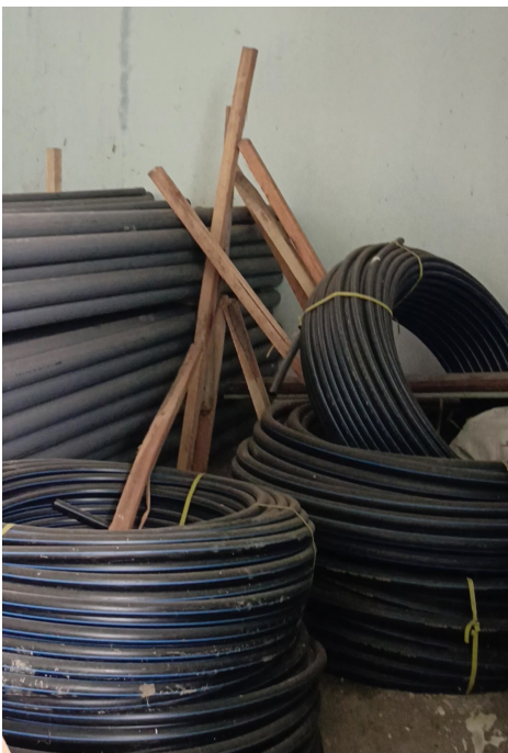
Figure 1: Pipe stockpile at public works office, Garut district, West Java to support quick recovery after disasters

“There is a facilitator [...] during the construction period. However, after PAMSIMAS started operating, there was no longer any technical assistance from [them or] other parties.”