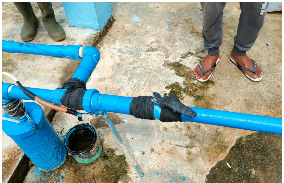
Figure 2: Minor repairs to pipework for groundwater source system in Dumai, Riau

“Also, for village government, we never got [financial] assistance because it is not the highest priority issue.”