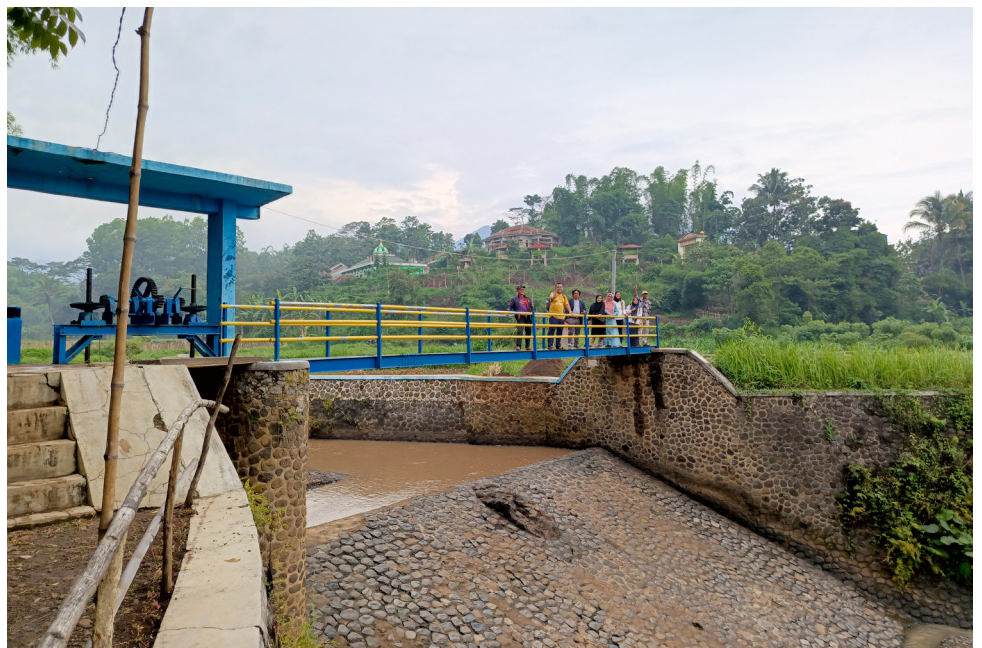
Figure 3: Repaired bridge protecting and improving surface water in KPSPAMS Mikti Binangkit, Sukawening District, Garut Regency, near the KPSPAMS Mukti Binangkit spring

Mining activities in Southeast Sulawesi (Wawonii Island) and elsewhere disturb the land and cave systems. In karst areas, it can lead to increased turbidity and contaminate spring water sources. Elsewhere palm plantations and other industry pollute water sources. Careful assessments of relevant water systems are needed prior to allowing mining activities.