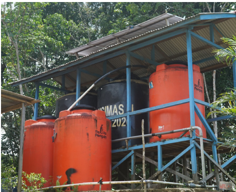
Figure 5: Water storage tanks for surface water system in Sintang, Kalimantan

“Every year there are floods and storms with lightning. The electronics [for the pump] were affected. We tried to handle the problem, but it happened again.”