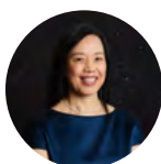
Pham Thi Bich Ngoc International Alumni Award