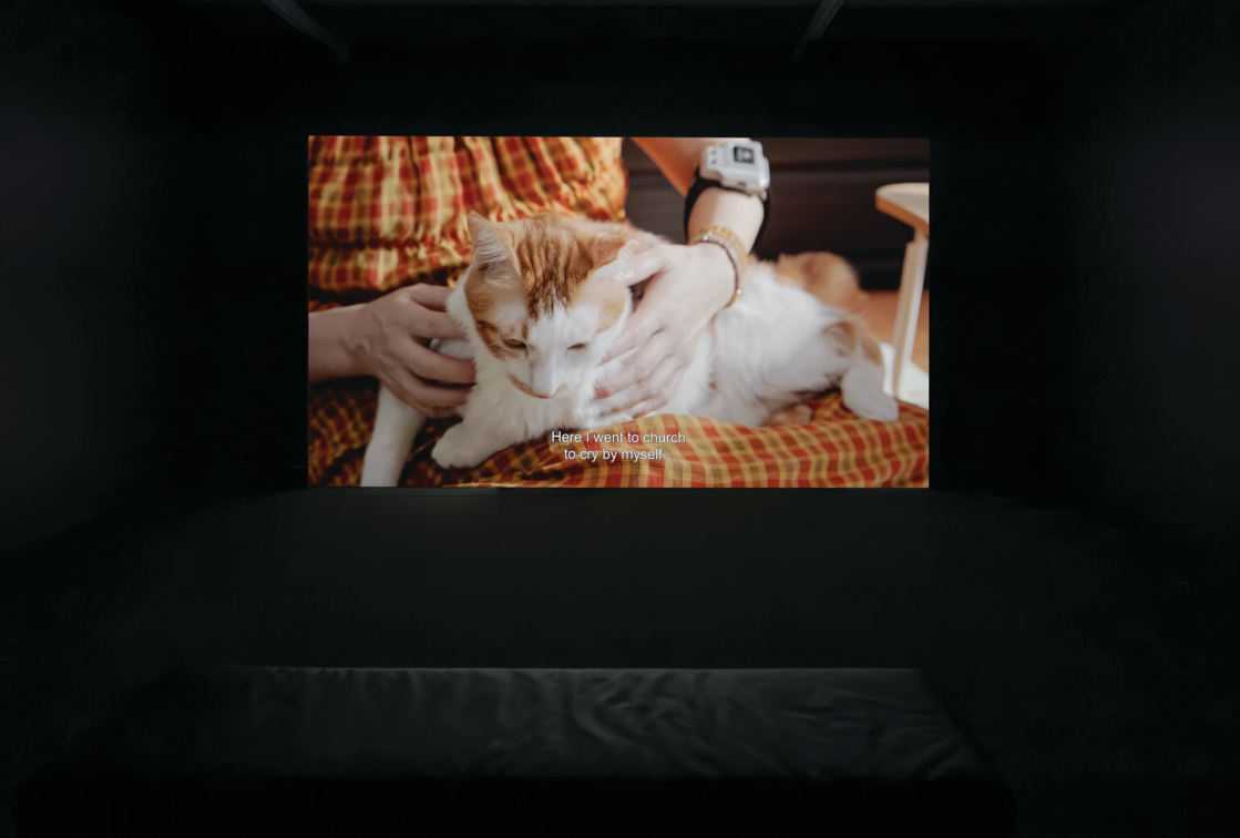
Here I went to church to cry by myself.