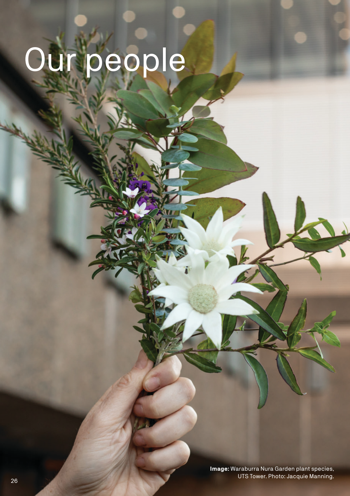
Image: Waraburra Nura Garden plant species, UTS Tower.