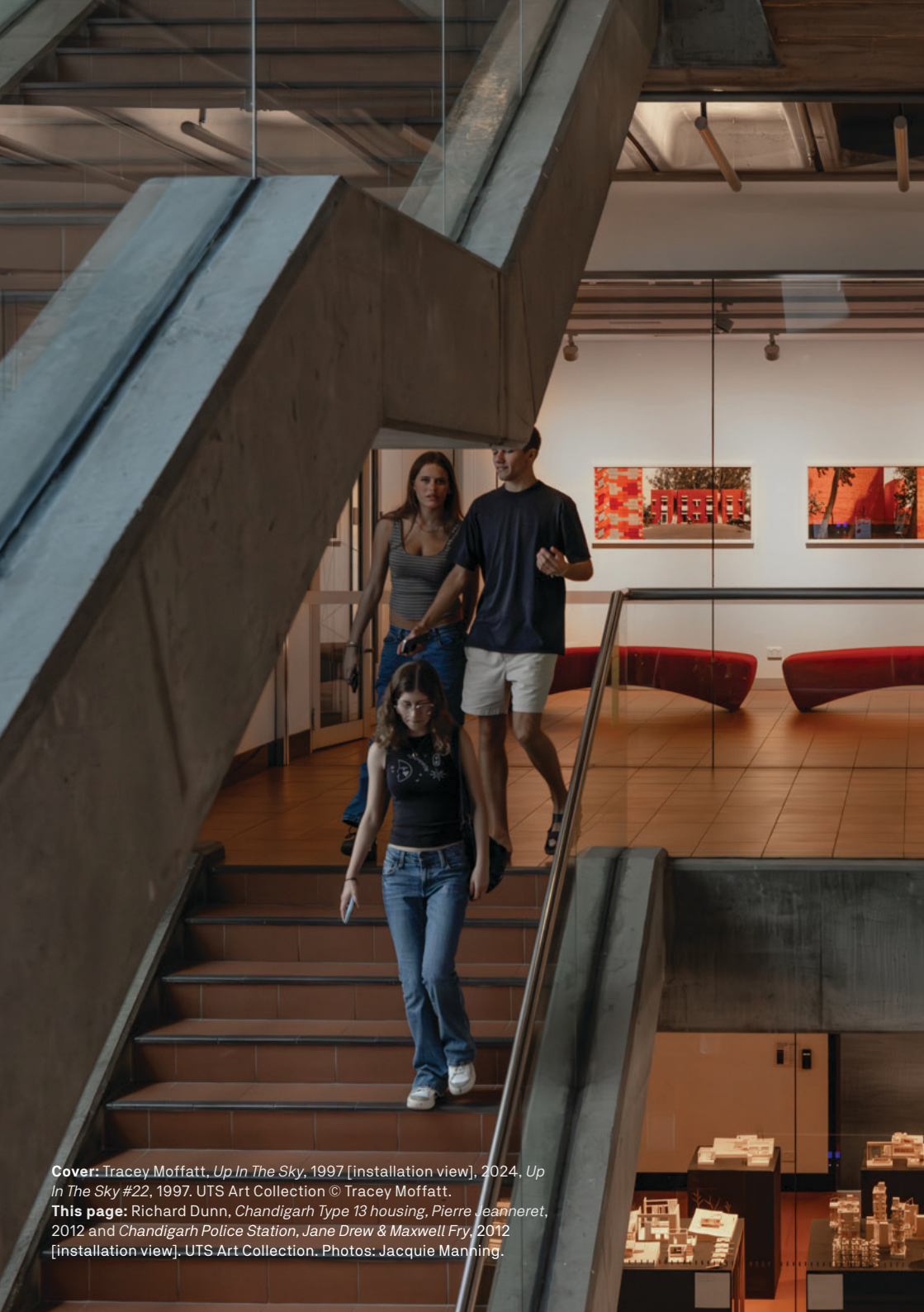
Cover: Tracey Moffatt, Up In The Sky , 1997 [installation view], 2024, Up In The Sky #22 , 1997. UTS Art Collection © Tracey Moffatt.