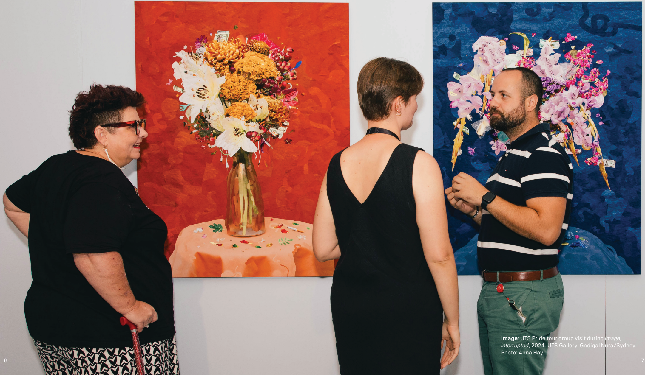
Image: UTS Pride tour group visit during Image, Interrupted , 2024. UTS Gallery, Gadigal Nura/Sydney.