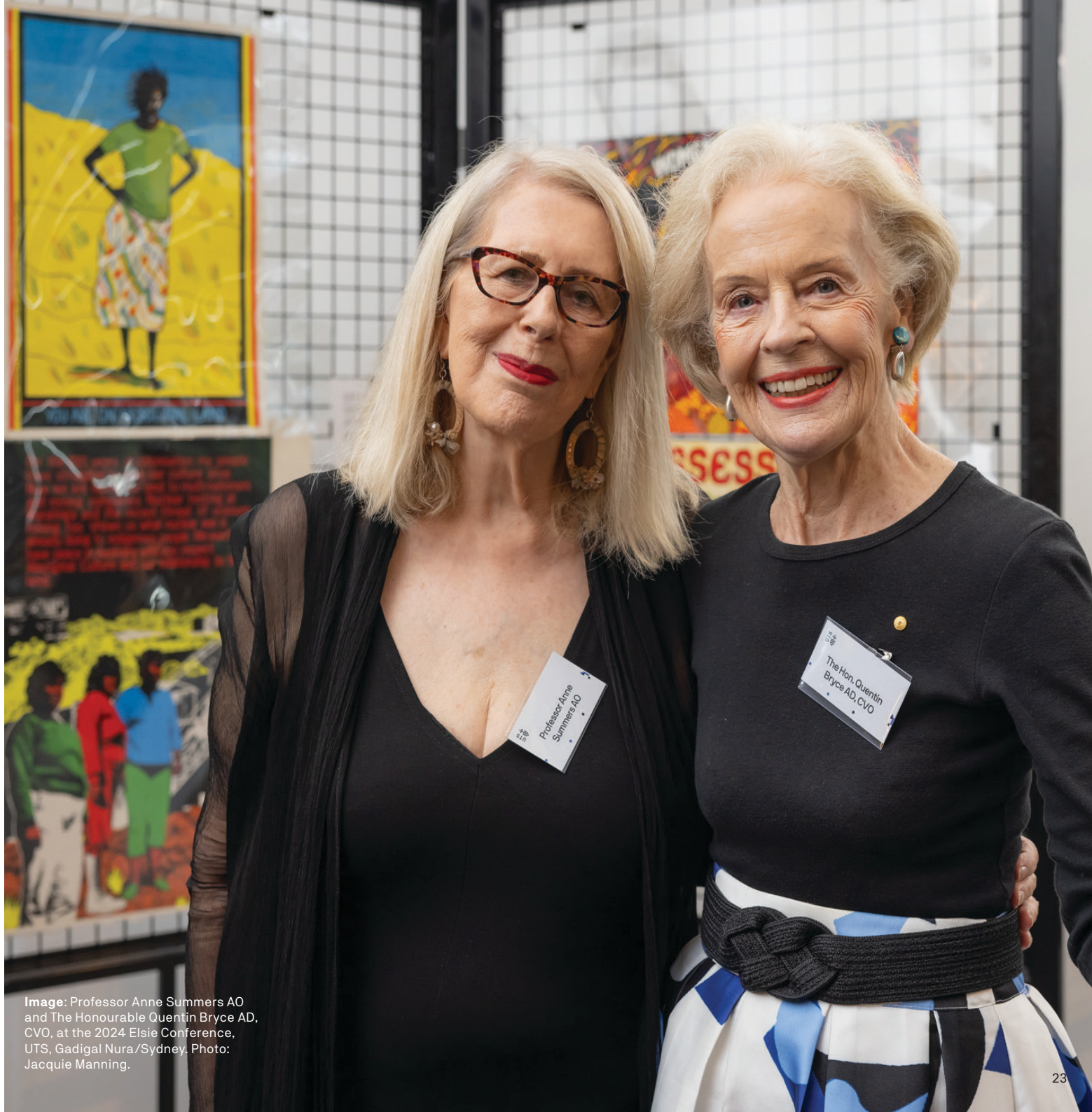
Image: Professor Anne Summers AO and The Honourable Quentin Bryce AD, CVO, at the 2024 Elsie Conference, UTS, Gadigal Nura/Sydney.

This year, our team framed and mounted 22 works by the renowned artist Tracey Moffatt. These efforts ensure the preservation and proper display of her significant contributions to contemporary art, enhancing the UTS Art Collection and visitor experience.