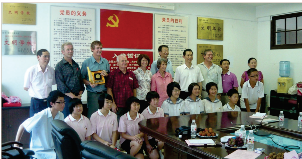
Visit to Jianjin High School, Nanping

As noted earlier, council has recently adopted a position which it has communicated both to Nanping and to the relevant organisations in Albury that they will need to develop their own sustainable relationships independent of council. Council is interested in learning how the most recent exchanges are progressing and what concrete outcomes they will achieve as a basis for determining its own future role in the sister city relationship; for example, Charles Stuart University's relationship with Nanping which has considerable potential for development.