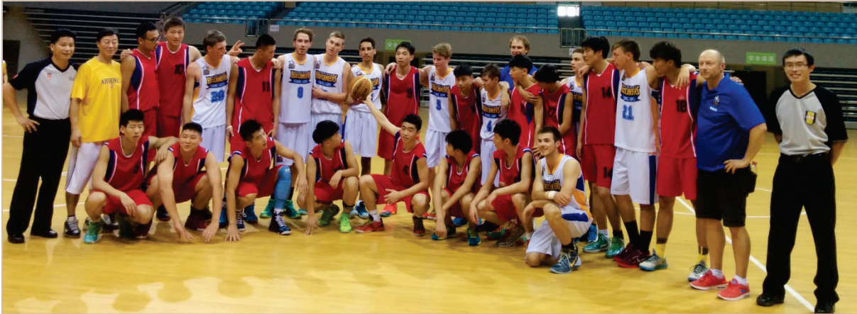
In July 2014, Geraldton Basketball Association Young Guns Team (20 athletes) toured in Shanghai, Zhoushan and Beijing for a youth basketball challenge.