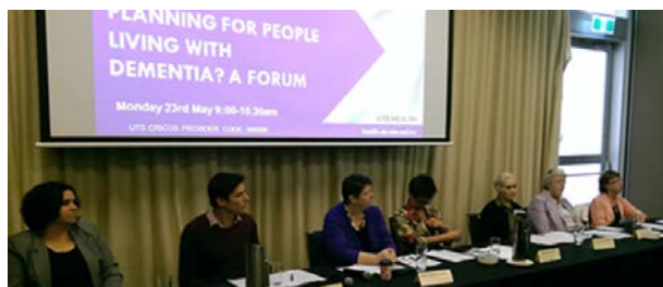
Panel members at the Dementia Care Planning Forum held at UTS, 23 May 2017