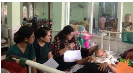
Palliative care clinic, Myanmar