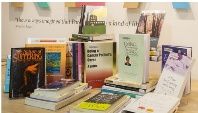
Part of the International Association for Palliative Care Library donation