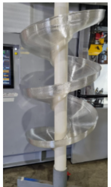
Sidewinder's bespoke 3D printing setup enables dual-material printing, real-time geometric correction and toolpath simulation, without the need for support structures.